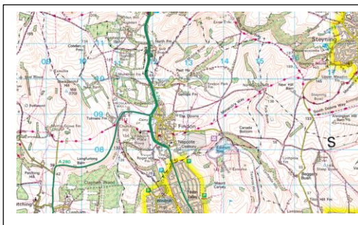
Land Use in Worthing and the South Downs National Park