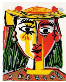
Woman with a hat self portrait